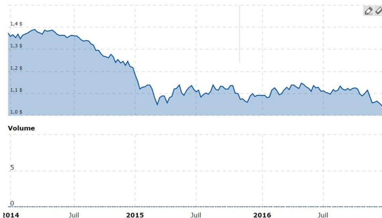
Graphique présentant la variation de la parité euro-dollar de 2014 à 2016

Grâce à cette méthode le risque de change est limité aux variations existant pendant la durée de d'exécution de chaque tranche de subvention, plutôt que pendant toute la durée du projet.